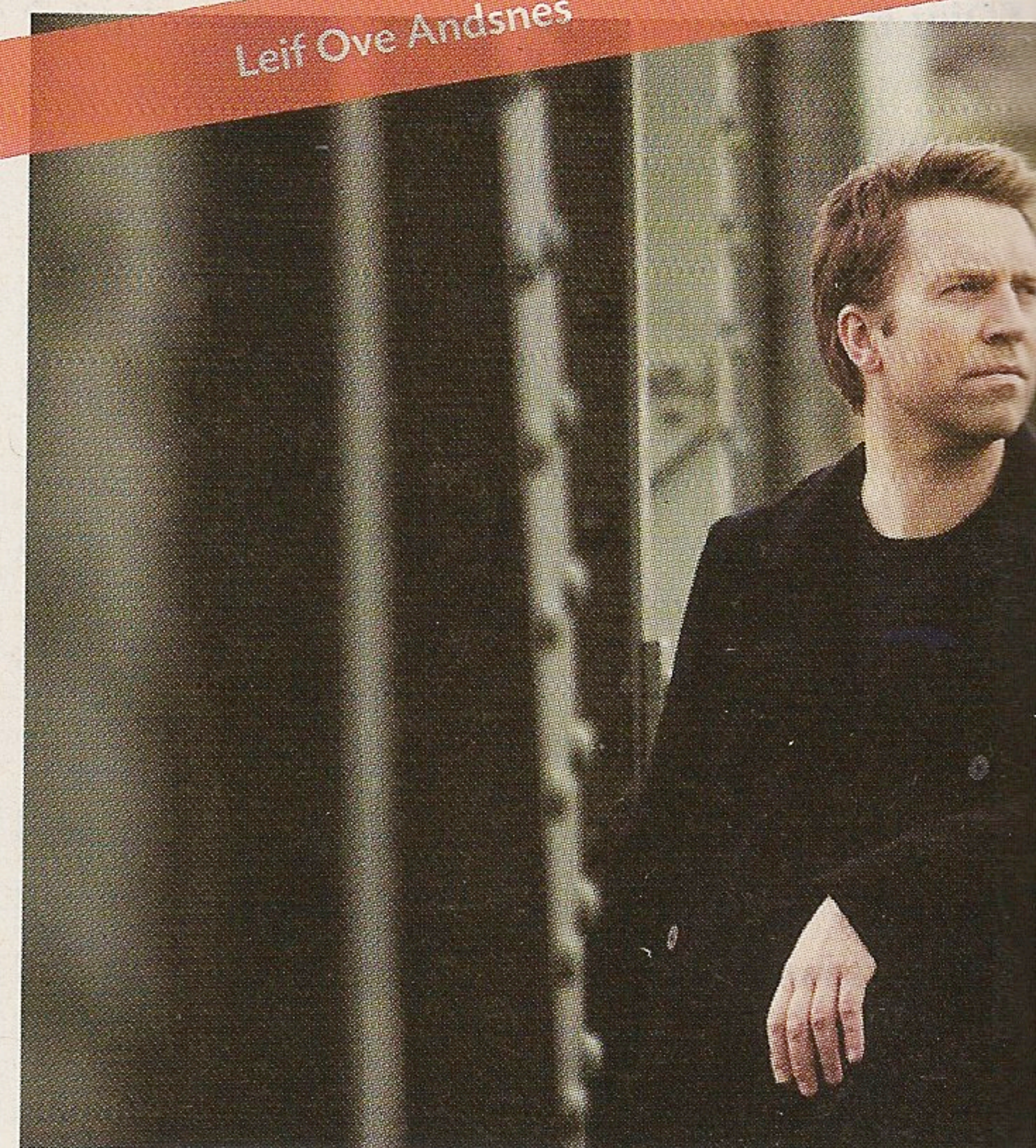
Leif Ove Andsnes